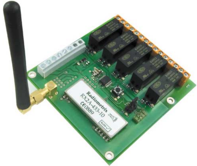
Figure 1: KDEC board (5-relay version)

KDEC is designed to provide the user with a complete receiver interface for Radiometrix transmitters such as KTX2 and KFX2. No additional parts needed to implement a complete system suitable for applications requiring high security RF remote control.